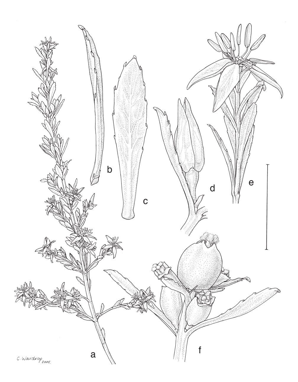
Fig. 2. Haloragodendron gibsonii. a , habit; b , c , leaf; d , bud (just beginning to open); e , flower; f , developing fruit (all from Wilson 1684 ). Scale bars: a = 75 mm; b–d = 8 mm; e, f = 10 mm.