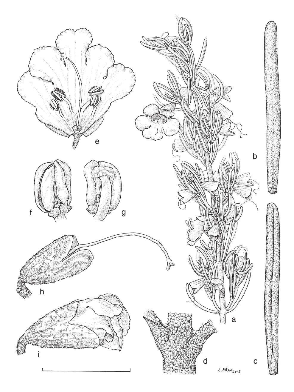
Fig. 2. Prostanthera teretifolia Maiden & Betche a , branchlet; b , leaf showing adaxial surface; c , leaf showing abaxial surface; d , detail of nodal area of branchlet and base of leaves; e , open flower showing corolla, stamens and gyneocium; f , stamen, showing ventral surface of anthers, locular appendages and minute connective appendage (visible between locules of anther); g , stamen showing dorsal surface of anthers, locular appendages and connective; h , fruiting calyx and persistent style and stigma (lateral view); i , flower bud (lateral view) (from Cambage s.n. , 29 Sep 1907, NSW 134430). Scale bar: a=20 mm, b, c, h & i=6 mm, d, f & g=2.4 mm, e=10 mm. Illustration by Lesley Elkan.