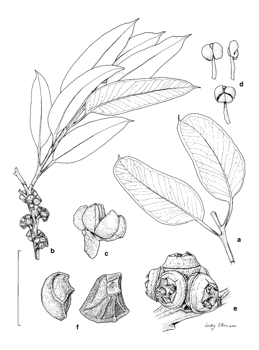
Fig. 1. E. boliviana. a, Juvenile leaves. b, adult leaves and inflorescences. c, inflorescence and buds. d, anther. e, inflorescence and fruit. f, seed. (from Williams 99187 & Clarke ). Scale bar: a, b = 8 cm, c = 2 cm, d = 2.5 mm, e = 3 cm, f = 4 mm.