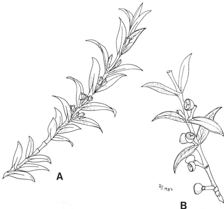
Fig. 1. Eucalyptus recurva Crisp. A , branchlet with developing buds (x 0.9). B , branchlet with fruit (x 0.9). (Both from life; R. Jean del.)

Even in the absence of external threats, the single known population of E. recurva must be endangered by its extremely narrow genetic base. Estimates of the number of individuals necessary to maintain a viable population vary widely (Fisher 1978, Ellyard 1987 and references cited in these), but by any standard, five may be too few. In fact, there is evidence that E. recurva is suffering the effects of inbreeding. Very few seeds are set (about one per capsule), and a good proportion of those appear to lack embryos. Attempts by M.A. Clements to germinate seed at the Australian National Botanic Gardens have met limited success. After stratification, seven out of ten seeds germinated but only one established a seedling. The survivor struggled to produce three pairs of leaves over several months, and then died. Subsequently, another batch of seed treated similarly produced a single seedling which grew slowly, reaching 10 cm in height after four months (Fig. 2F). The lack of seedling vigour suggests that a post-zygotic lethality system may be operating in this taxon.