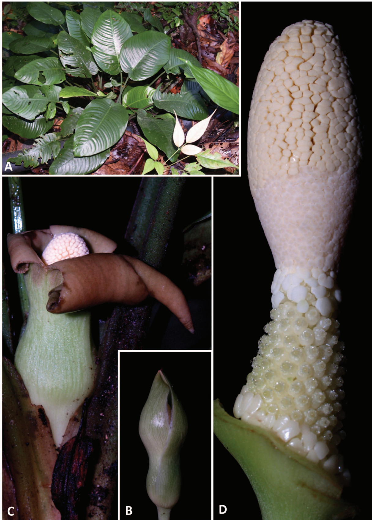
Fig. 3. Schismatoglottis multinervia M.Hotta. A , plants in habitat; B , inflorescence at onset pistillate anthesis (note the small gap that is created by the expansion of the spathe limb); C , inflorescence at onset of staminate anthesis, the spathe limb has expanded and split longitudinally, at the same time darkening, and the pubescent petiole is clearly visible; D , spadix at pistillate anthesis with the spathe artificially removed (note that the interstice staminodes are short and have rounded tops, the distal part of the staminate zone is the same diameter at the base of the appendix, and the appendix is blunt). A–D from AR-1932.