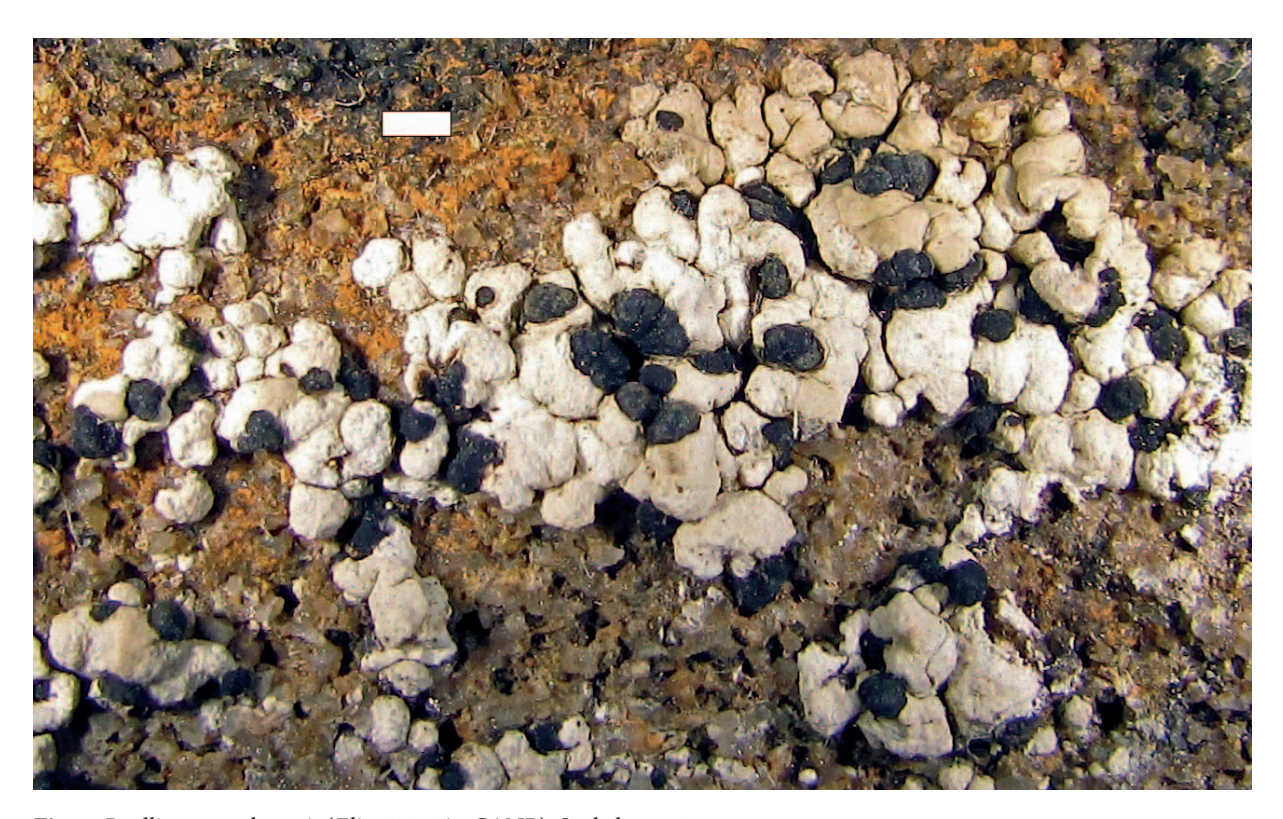
Fig. 5. Buellia maunakeansis (Elix 10351 in CANB). Scale bar = 1 mm.

United States of America: Hawai'i: Oahu, Kailua Beach Reserve, 21°24'N, 157°44'W, alt. 2 m, on volcanic rocks along the foreshore, J.A. Elix 13517 , 9 Jul 1983 (CANB).