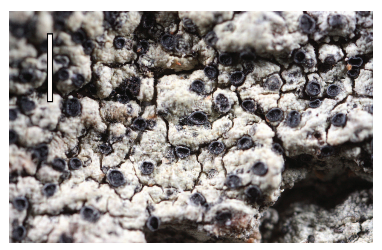
Fig. 2. Gassicurtia albomarginata (holotype). Scale bar = 1 mm.

Distribution and habitat: At present, this new species is known only from the type locality. Associated species included Graphis ceylanica Zahlbr., G. subserpentina Nyl., Leiorreuma exaltatum (Mont. & Bosch) Staiger, Parmotrema neocaledonicum (Nyl.) Elix, P. saccatilobum (Taylor) Hale, P. tinctorum (Despr. ex Nyl.) Hale and Thecaria montagnei (Bosch) Staiger.