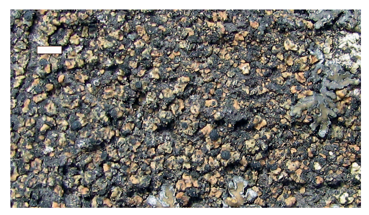
Fig. 3. Monerolechia papuensis (holotype). Scale bar = 2 mm.