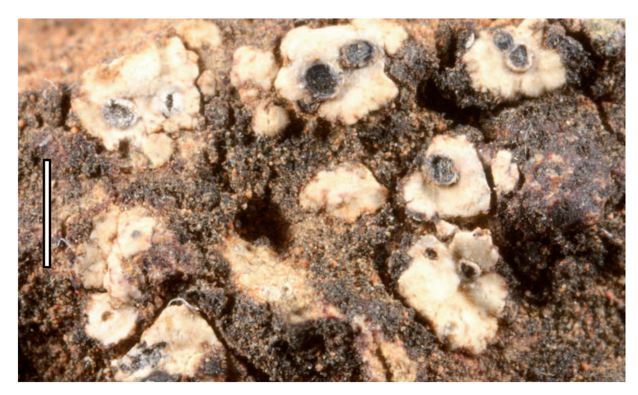
Fig. 1. Buellia rarotongensis (holotype). Scale bar = 1 mm.